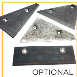
Mixer blades, Hardox-steel Item no. 200 024S